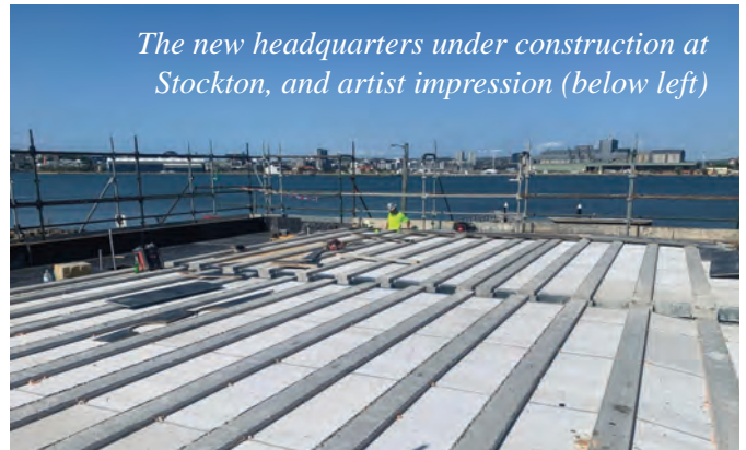
The new headquarters under construction at Stockton, and artist impression (below left)

the building is coming along very well, with a current finishing date of late June.