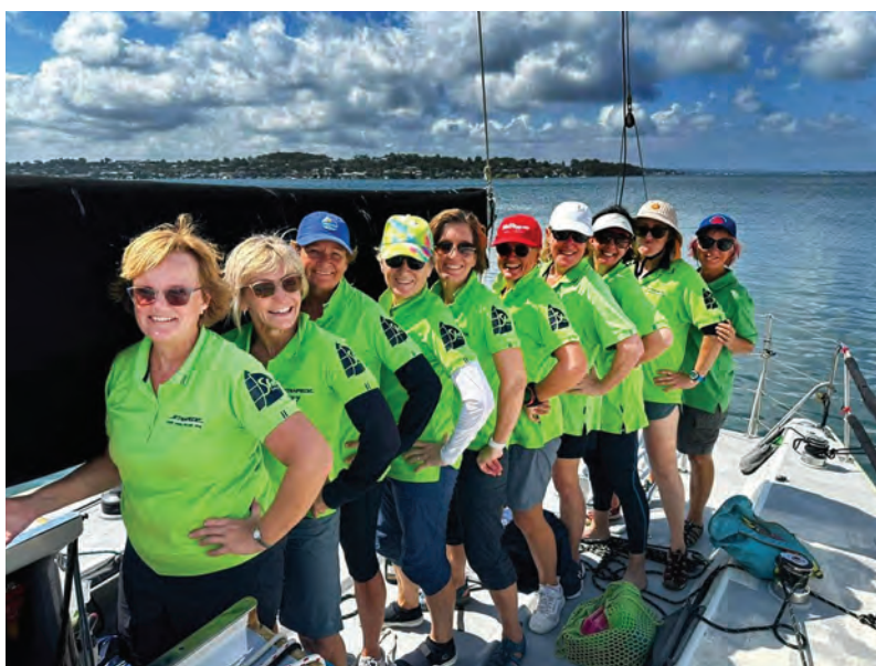
Above: The crew of Stampede matched the colour of their yacht's hull.