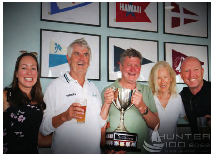
Above: The crew of Trim savour their handicap victory in the inaugural offshore classic.

In the darkness of night, our fleet mixed into the CYCA's Cabbage Tree Island race after having rounded Bird Island